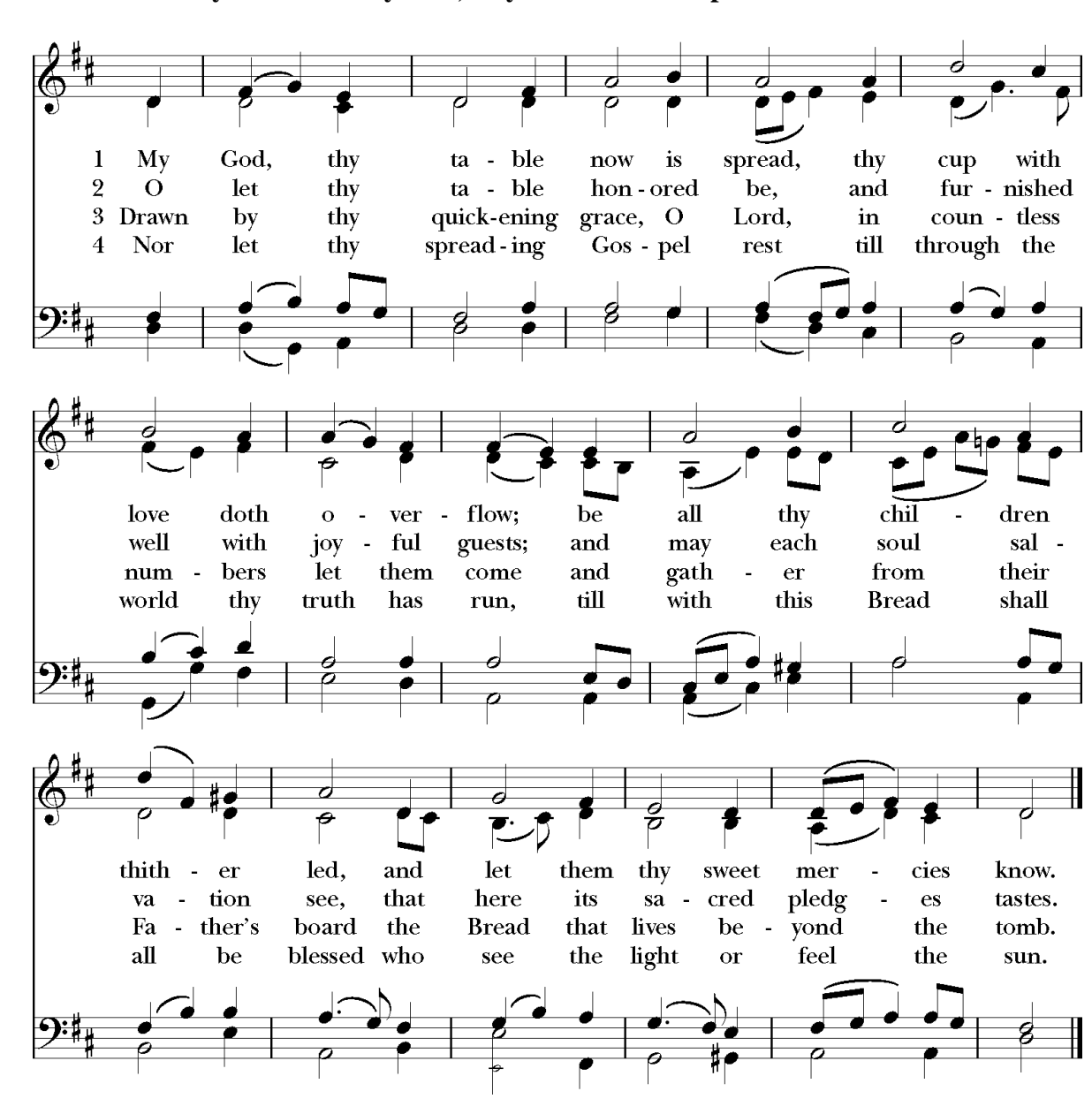
Words & Music: The Church Pension Fund, © 1985; All rights reserved. Reprinted under ONE LICENSE #707505-A and CCLI #1780828.