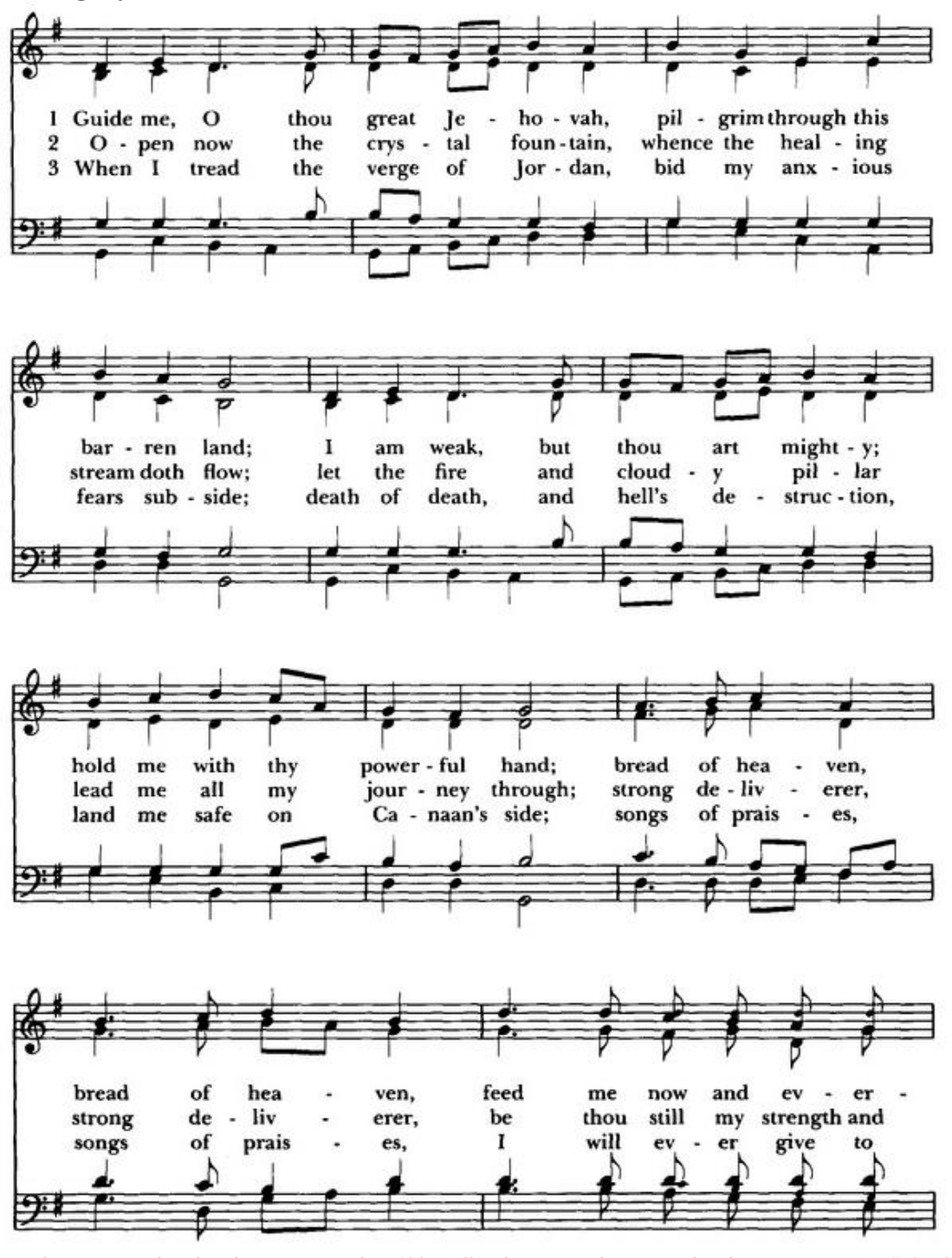
Words & Music: The Church Pension Fund, © 1985; All rights reserved. Reprinted under ONE LICENSE #707505-A and CCLI #1780828.